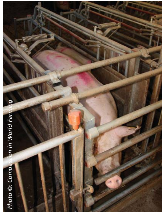
Sow stalls in an intensive pig farm, Denmark

4. Four diets were defined, based on different calorie counts and varying proportions of animal products. Countries with high gross domestic product (GDP) per capita on average consume more food and have a higher proportion of animal products in the diet than countries with low GDP. For example, the average North American consumes twice as much protein as an average Sub-Saharan African, with almost two-thirds of protein coming from animal products, compared to just one-fifth in the case of an average Sub-Saharan African.