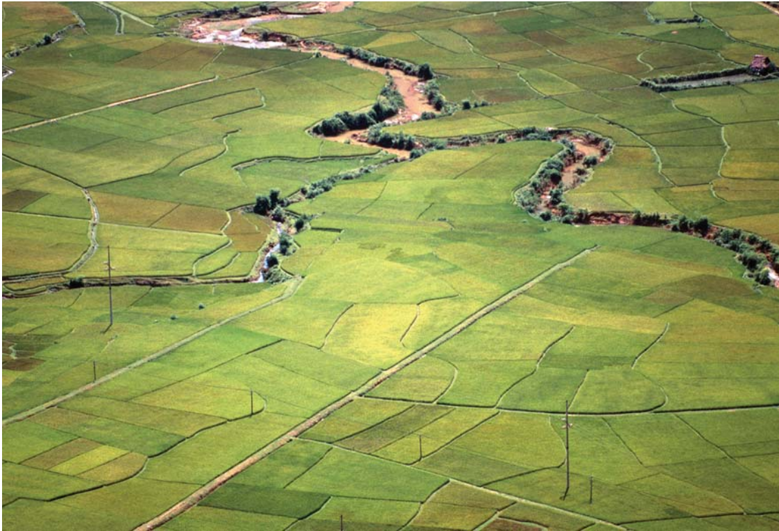
Humans already use 75.5 per cent of the world's land, creating a challenge for feeding the growing population

The full research study, entitled 'Eating the Planet: Feeding and fuelling the world sustainably, fairly and humanely' focused on land and biomass use, including cropland farming, livestock rearing, bioenergy production and conversion of primary biomass to food and fuel. It was not within the scope of the primary research to consider the social, economic and political factors which influence decisions on production, diet, land use or choice of technology. This briefing summarises the findings of the study and looks at their implications.