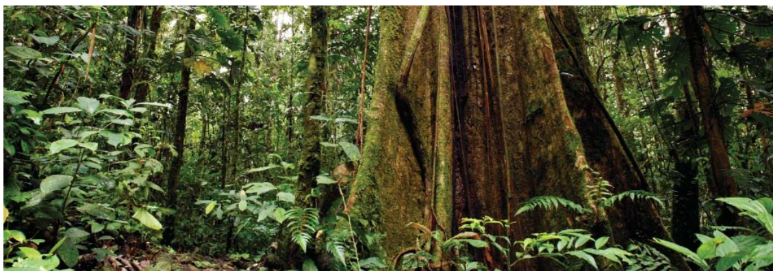
Forests are critical for the Earth's survival