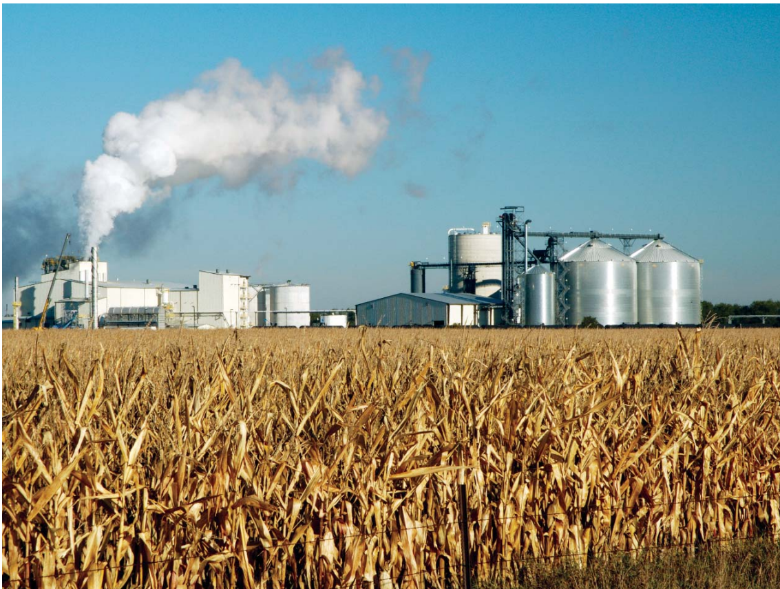
Large-scale production of biofuels will lead to an increase in food scarcity and rising prices

A wealth of studies from international organisations - the FAO, the World Bank, the OECD and the Royal Society amongst others - have warned that exploiting the world's theoretical bioenergy potential will have dramatic negative social and ecological impacts, such as further pressure on small farmers and communities that depend on the land, upward pressure on food prices and land rights conflicts. It could also trigger indirect land use change such as deforestation in South East Asia and Latin America. In the worst cases this would result in net increases in greenhouse gas emissions.