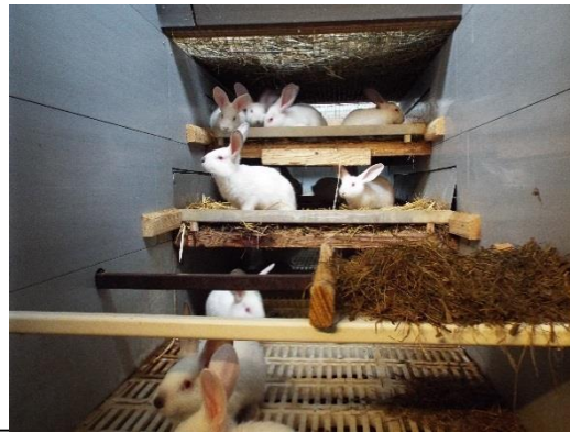
Images 3 and 4: A doe carrying straw to build her nest. In the park system (right) the platforms and other enrichment material are visible. The varying levels and the length of the pen allow for more natural behaviours such as running, jumping, hopping and hiding.