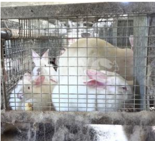
Image 1: The majority of rabbits in the EU are farmed in Italy, Spain and France where does are typically kept in these small barren cages.

Unfortunately, developments in the housing for does are less advanced, even with Belgium's legislation aiming for group housing by 2021 2 , focussing on 'enriching' the individual cage (Image 2). The cage has slightly more height at 40cm with a platform giving an additional lying area of 25%. The platform may have plastic covering the wire for increased comfort. Gnawing objects and hay may also be provided.