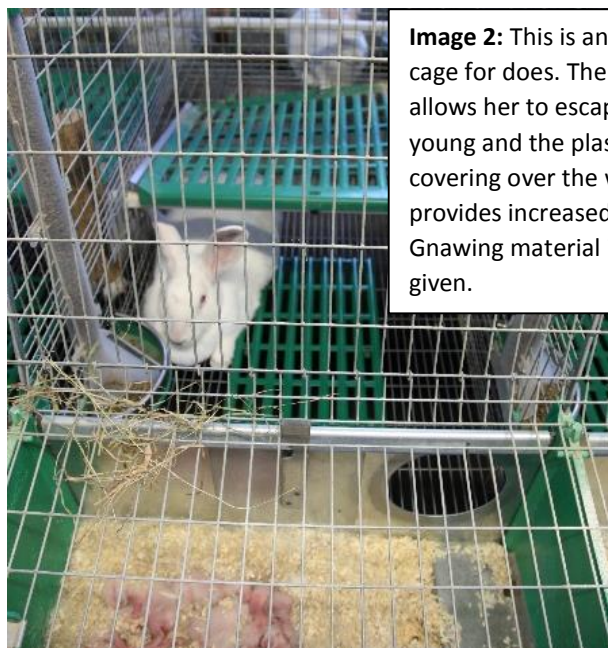
Image 2: This is an enriched cage for does. The platform allows her to escape her young and the plastic covering over the wire provides increased comfort. Gnawing material is also given.

Keeping does in cages, either barren or enriched does not adequately provide for the behavioural needs of the doe – particularly positive social interactions with other adult rabbits, and activities such as running, hopping and stretching. Restriction of these behaviours often leads to stereotypic behaviour (such as repetitive bar gnawing or fur plucking), characteristic of bored and frustrated animals.