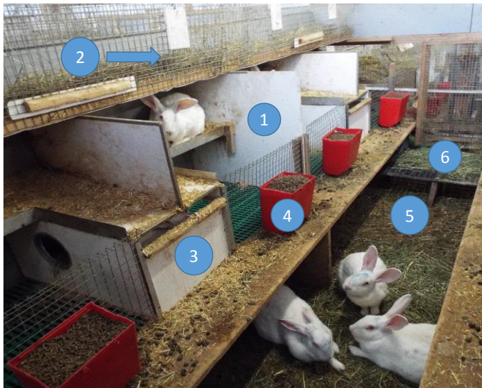
Image 6 - Does are kept in groups of 8. From 10 days post-partum they are free to move around the pen. There are many hiding places for rabbits if they need to escape an aggressor. The multiple levels allow much more movement for the does, which improves bone strength 5 . Here you can see does socialising. Rabbits enjoy allo-grooming as well as body contact 2 . The solid flooring gives better comfort and hock lesions are not seen in this system (they are typical in caged systems).

(1) Barrier between individual kindling areas (2) wire lid is lowered for 12 days to enclose the does (2 days pre- and 10 days post-partum)(3) Nesting box (4) Ad-libitum pellet feeder (5) Open space on solid flooring for does 10 days post-partum (6) Platform and shelter for additional hiding if needed to escape an aggressor or to rest.