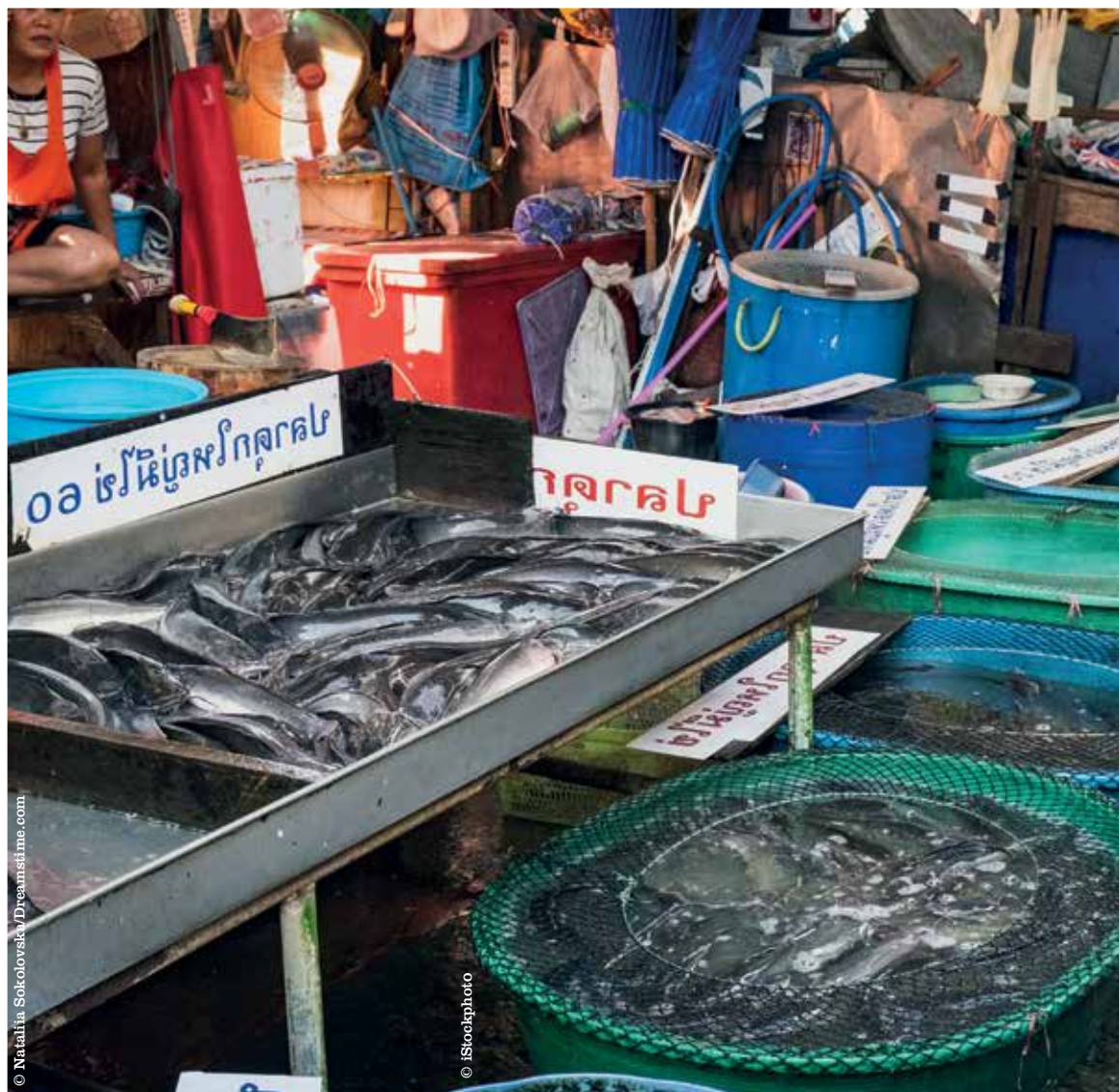
Selling of live fish at a wet market

Pangasius are sold at wet markets (live animal markets). The fish sold at these markets are kept in crowded conditions for long periods. During this time, the water quality degrades, exposing the fish to low quality environmental conditions. When a fish is selected by a buyer, it is handled out of water, often roughly potentially causing injuries. This causes extreme stress for the fish. It is then often exsanguinated without prior stunning (see Text box 1) or left to asphyxiate without prior stunning (see Text box 2). This practice causes long periods of stress, pain, and suffering. Pangasius should be humanely slaughtered and should not be sold at wet markets.