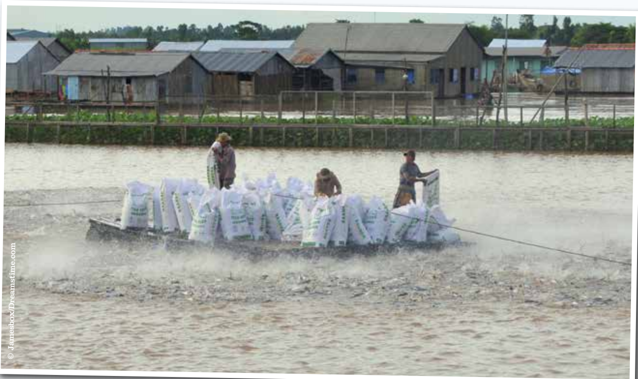
Pangasius pond farm in Vietnam

Information on Pangasius bocourti and Pangasius hypophthalmus are combined in one document as these are often farmed and slaughtered using the same methods although P. bocourti are less commonly farmed as they grow more slowly and are more expensive to produce 3 . However, these are different species with different behavioural and physiological responses to stress 4 , therefore specific information on each species is given where available.